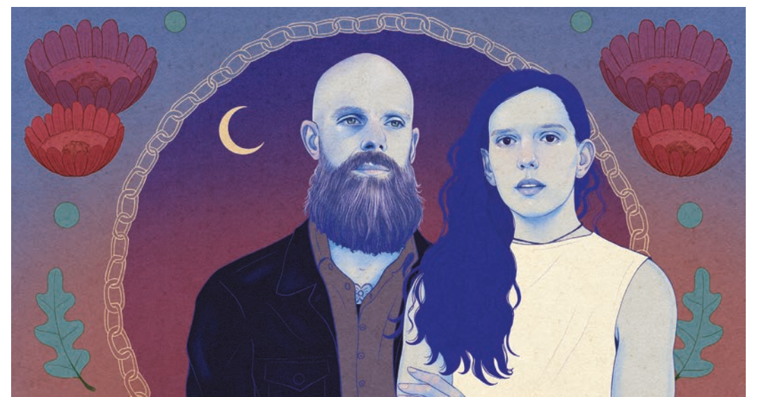
Artists who champion good causes. We work with major progressive brands to communicate their message and align our mutual values by connecting them with diverse, genuine and individual talent.